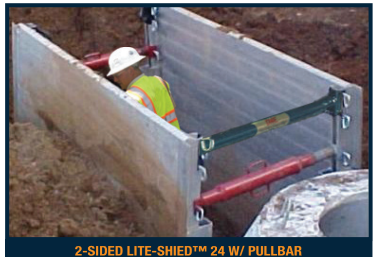
2-SIDED LITE-SHIELD™ 24 W/ PULLBAR