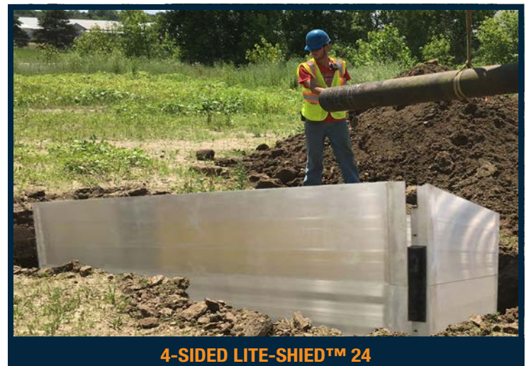
4-SIDED LITE-SHIELD™ 24